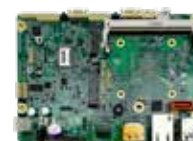
3.5" SBC AECX-APL7