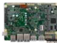
3.5" SBC AECX-KBL6